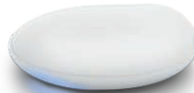
PowerView Gen 3 Gateway