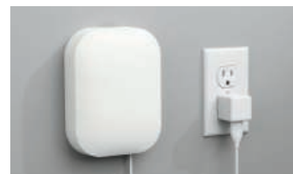
PowerView Gen 3 Gateway Mount

The PowerView Gen 3 Gateway Mount provides an elegant solution to affix both Gateways to a variety of mounting surfaces including ceilings and walls.