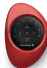
PowerView Gen 3 Remote