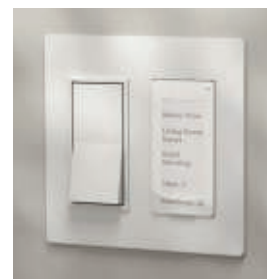
Gen 3 Scene Controller Surface Mounted