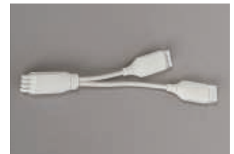
PowerView+ Daisy-Chain Cable