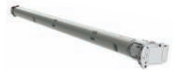
Internal Rechargeable Battery Motor

Reference the Designer Roller, Designer Banded and Alustra Sell Sheets for more information.