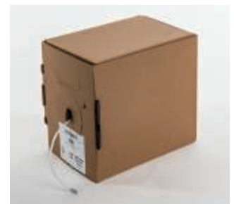
PowerView+ Bulk Cable

Amazon, Alexa, and all related logos are trademarks of Amazon.com, Inc. or its affiliates. Apple is a trademark of Apple Inc., registered in the U.S. and other countries. HomeKit is a trademark of Apple Inc. Google is a trademark of Google LLC.