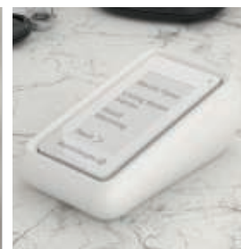
Gen 3 Scene Controller in Holder