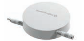
Retractable Charging Cable